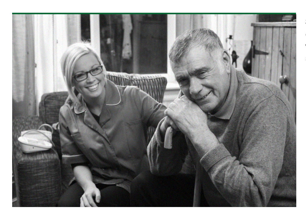
Social care fraud can hurt the most vulnerable in society.

43 The number of personal budgets has increased by 55 per cent in the last year alone (Ref. 9). The Department of Health is urging councils to provide personal budgets for everyone eligible for continuing social care, preferably as a direct payment, by April 2013 (Ref. 10). Such a significant change in the way adult social care is delivered, though clearly providing improved choice and control for users, also increases the risk of fraud. It is important that councils adopt a proportionate response, balancing the risk of fraud against the benefits for users that personal budgets provide.