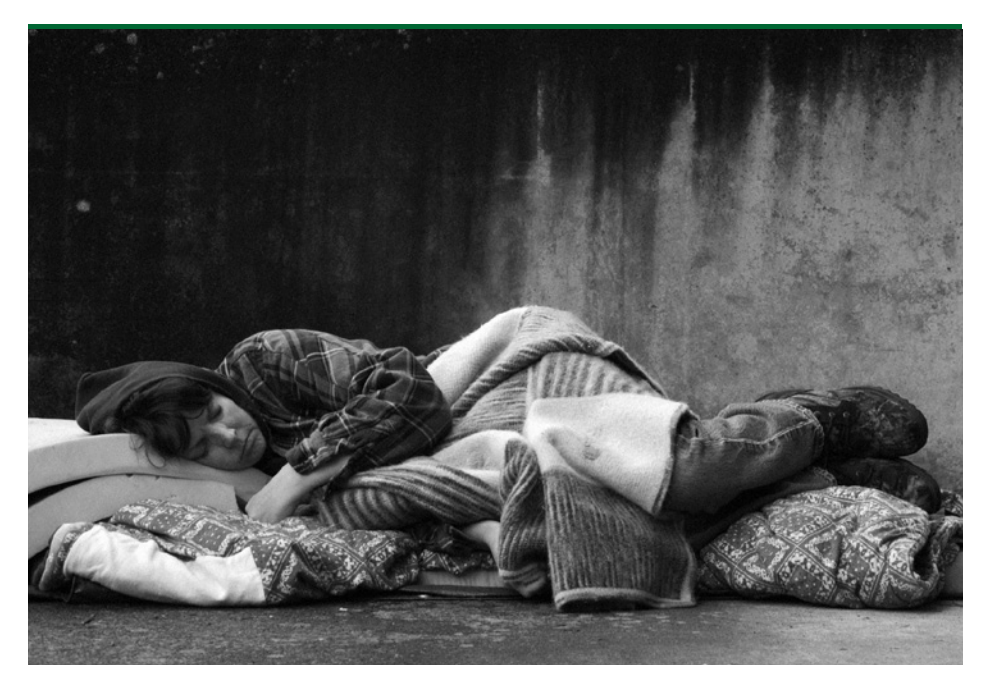
Recovering wrongfully occupied properties frees up homes for those in genuine need.

21 Tackling housing tenancy fraud is one of the most cost-effective means of making social housing properties available to match the demand from those in genuine need. It also reduces the significant financial loss to the public purse caused by this fraud.